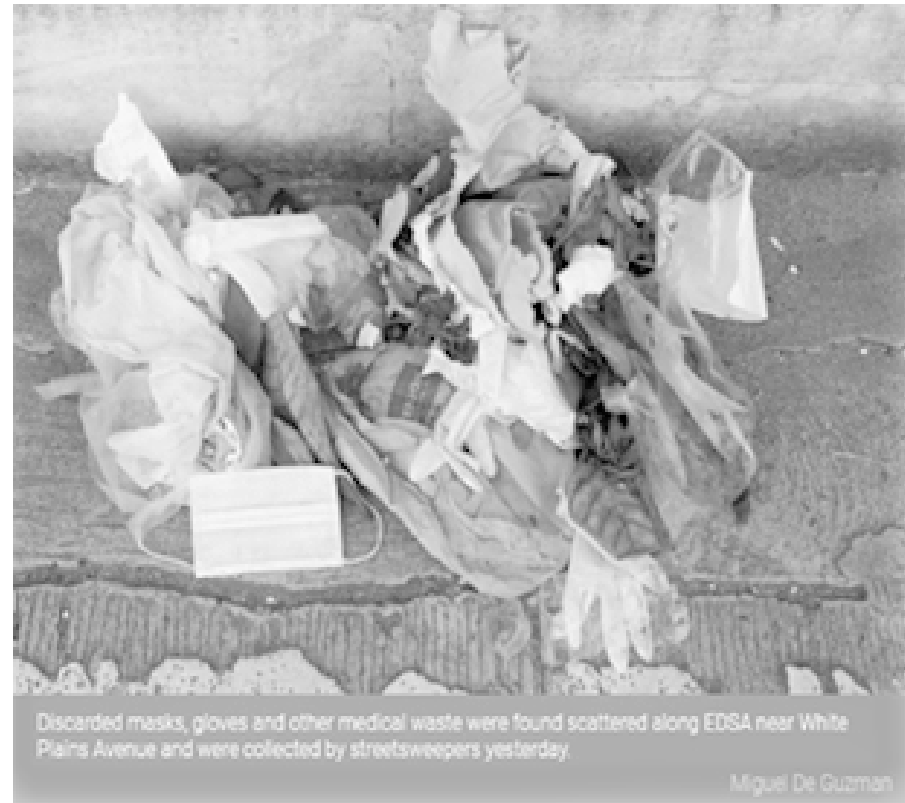
Discarded masks, gloves and other medical waste were found scattered along EDSA near White Plains Avenue and were collected by streetsweepers yesterday.

The DENR official also reminded hospitals and other health care facilities of their obligation to segregate their trash using color-coded bags, disinfect medical waste, and make sure proper transfer procedures are observed.